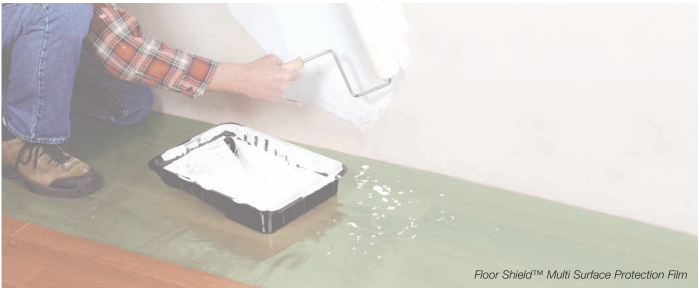
Floor Shield™ Multi Surface Protection Film