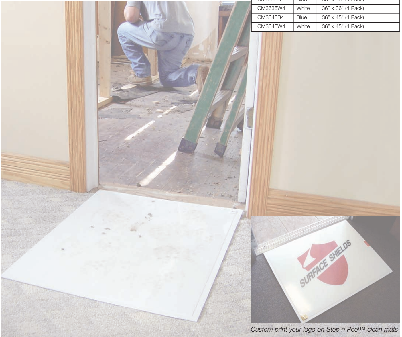
Custom print your logo on Step n Peel™ clean mats